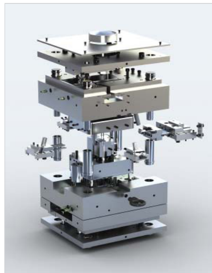
This moldbase was developed with PTC Creo Expert Moldbase Extension and rendered in PTC Creo Parametric™.